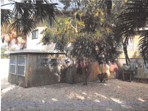
EQUIPMENT VIEW 10/20/2014